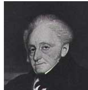
Arthur Guinness II

Founder member of the Society for Improving the Conditions of Children Employed as Chimney Sweepers Governor of the Bank of Ireland in 1820 President of Dublin Chamber of Commerce