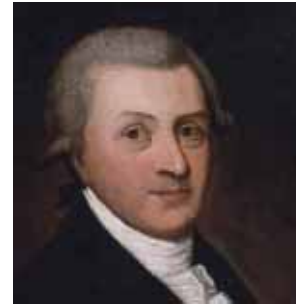
Arthur Guinness I

1763 Elected Warden of the Dublin Corporation of Brewers 1767 Master of the Corporation of Brewers Late 1770s, became brewer to Dublin Castle Governor of the Meath Hospital Board Donated 250 guineas to the Chapel Schools of St. Patrick's, beginning the longstanding relationship between the Guinness family and the cathedral.