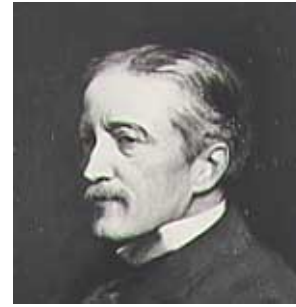
Edward Cecil Guinness

Donated £50,000 for distribution among the hospitals of Dublin