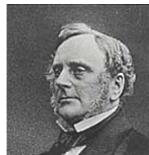
Benjamin Lee Guinness

Lord Mayor of Dublin, 1851 Elected as Minister for Parliament for Dublin city in 1865 Donated £150,000 for restoration of St. Patrick's Cathedral during 1860 - 1865 Began restoration of Marsh's library