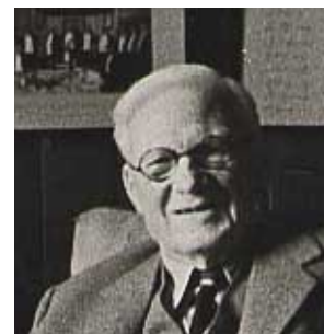
Rupert Edward Guinness

Awarded insignia of a Knight Companion of the Most Noble Order of the Garter, 1948