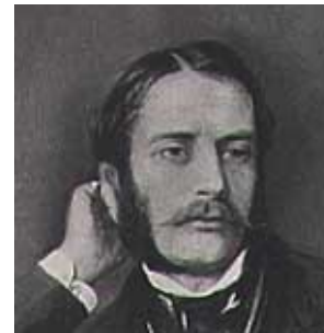
Arthur Edward Guinness